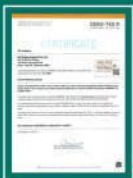
Oeko - Tex

Our commitment to high quality standards and environmental friendly approach are endorsed by internationally recognized certificates