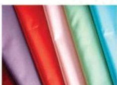
VOILE / CAMBRIC