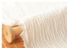
CREPE / CRINKLE