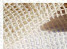
MESH / NET