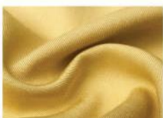
TWILL & DRILL